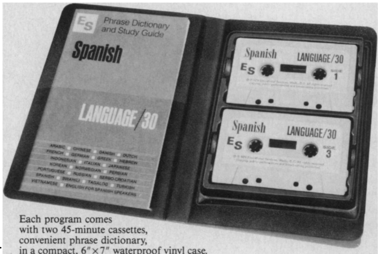
Each program comes with two 45-minute cassettes, convenient phrase dictionary, in a compact, 6" x 7" waterproof vinyl case.

So, whether you're going abroad for a short trip or an extended stay, you'll find that the fluency you've gained from Language / 30 will make your visit easier, more pleasant, and more enriching. Instead of being a "stranger in a strange land," you'll be able to converse freely with the natives in their own language.