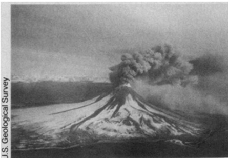
U.S. Geological Survey

The picture at left shows a theoretical model, confirmed by earlier microscopic views, of a silicon atomic structure, magnified about 30 million times. The diamond-shaped outline reveals the repeating unit that makes up the complete surface. The picture at right shows wispy bonds that reach up from a sample's second atomic layer and connect with surface atoms, seen as bright spots.