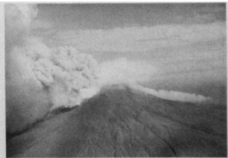
In a calmer continuation of its March eruption (left), Alaska's Augustine volcano spews ash and steam (right).

proportion of gases, which bubble out of the upwelling molten rock. If a dome seals the opening of the volcano, the pressure builds up inside until the gas explodes in a new eruption.