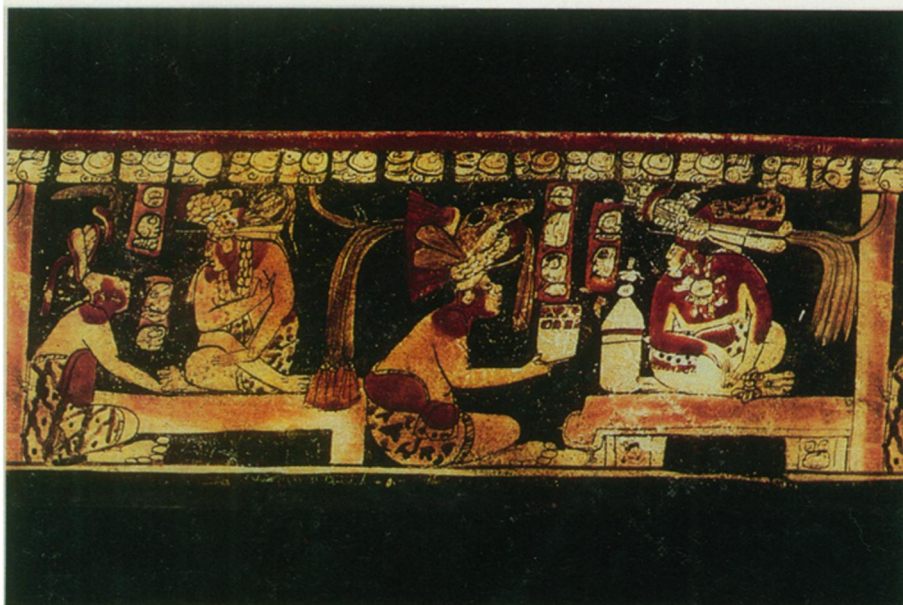
George Braziller, 1986, 10" x 10", 320 pages, hardcover, $45.00

Science News Books 1719 N Street, NW Washington, DC 20036