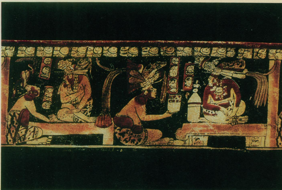
George Braziller, 1986, 10" x 10", 320 pages, hardcover, $45.00

Science News Books 1719 N Street, NW Washington, DC 20036