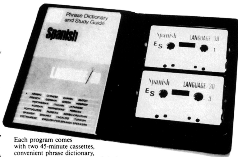
Each program comes with two 45-minute cassettes, convenient phrase dictionary, in a compact, 6" x 7" waterproof vinyl case.

So, whether you're going abroad for a short trip or an extended stay, you'll find that the fluency you've gained from Language/30 will make your visit easier, more pleasant, and more enriching. Instead of being a "stranger in a strange land," you'll be able to converse freely with the natives in their own language.