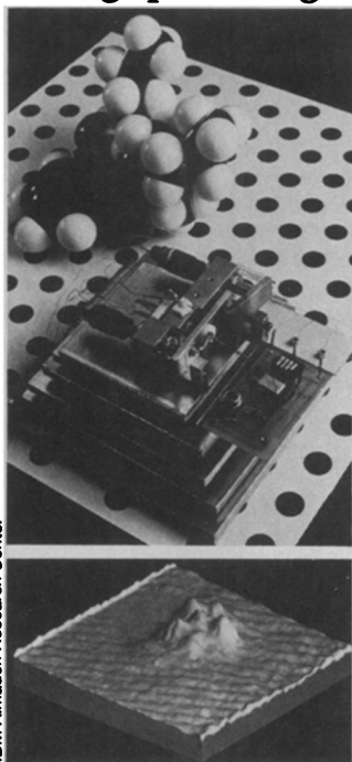
IBM Almaden Research Center

The scanning tunneling microscope, invented only a few years ago, is already an important tool for obtaining images that reveal the locations of individual atoms on surfaces (SN: 10/25/86, p.262). Lately, scientists have also been investigating the use of the same apparatus for altering surface structures and for manipulating matter at the atomic level. Now a team of researchers at the IBM Almaden Research Center in San Jose, Calif., reports success in pinning small organic molecules to a graphite surface. The researchers also have evidence indicating that they were able to split a pinned molecule into smaller pieces — perhaps the most delicate chemical surgery yet performed.