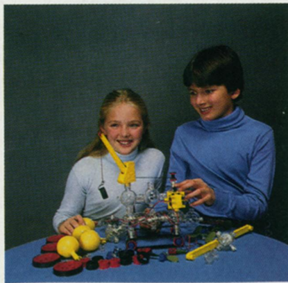
Model 700: Study all the moving parts in action through the see-thru capsules. See the crown wheel activate the speed reduction gear which powers the axles and sets your vehicle in motion. Learn basic principles of electricity, aerodynamics, flotation and physics as you construct the sturdy "Crane" or the "Submarine." Set includes 90 parts and constructs 56 models plus your own creations.