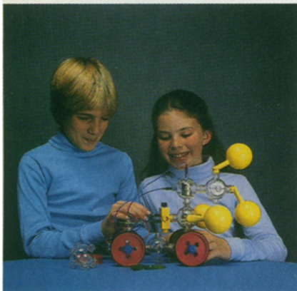
Model 400: Construct the action "Land Rover" or the "Speedboat." Set includes 48 parts and you can construct up to 22 different models.