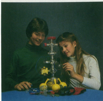
Model 500: Set includes 7 functioning capsules which enable you to construct a variety of exciting models: "Fire Engine," "Moon Rover," "Ferry Boat," "Elevator." Discover principles of physics, electricity and mechanics. See the gears run with precision accuracy through the clear capsules as they propel your model. Set includes 72 parts and builds 39 models plus your own creations.