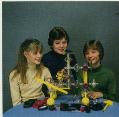
Model 1000: Chain wheel drive action vehicles and other dynamic models you can easily build using toothed gear chain links in combination with extender bar connectors. Watch the incredible gears run with precision accuracy through the clear capsules as you construct an overhead "Ropeway" or the racy "Motorcycle" or the fan drive "Floor Polisher." Set includes 180 parts and builds 85 models.

Capsela is a unique concept in construction sets which uses both electrical and mechanical theory.