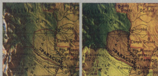
Turned off (left) The Mercury depicts land and ocean topography—switched on (right) the political world, including current boundaries and international borders, is revealed in eight vivid colors.

Now it's easier than ever to let the Mercury light up your home. Only Barnes & Noble is able to offer this outstanding globe—normally sold for $48.95—for the astonishingly low price of ONLY $29.95! Never before—and probably never again—will a globe of such high quality be offered at such a low price.