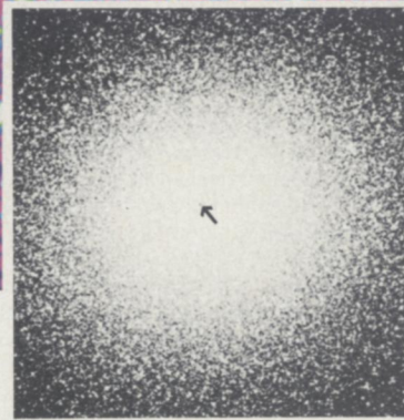
European Southern Observatory

Whereas mirrors in conventional telescopes keep their shape by relying on the thickness of the glass used, the NTT is the world's first telescope for general astronomical use that utilizes "active" optics. Its 3.58-meter mirror is only 24 centimeters thick. Computer-controlled supports pressing against its back maintain the mirror's shape (SN: 3/19/88, p.188). The 10-meter Keck telescope now being constructed on Mauna Kea in Hawaii uses a similar principle.