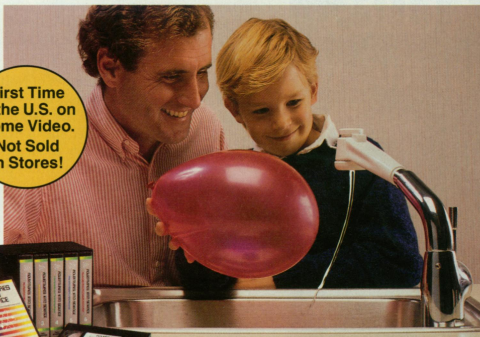
"Look, Dad. Static electricity can actually bend water!"

First Time in the U.S. on Home Video. Not Sold in Stores!