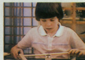
Learn how machines work.