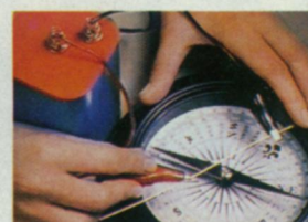
Learn about the powers of magnetism.