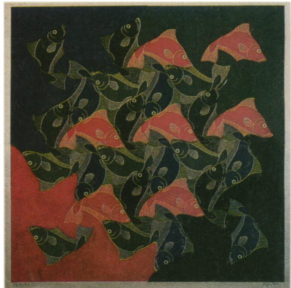
Woodcut of Escher drawing number 20 — decorative fish printed on white silk; c. 1942.

W.H. Freeman, 1990, 354 pages, 9¼" x 11¼", hardcover, $42.50