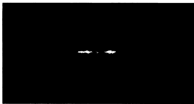
Milky Way map shows emission by ionized nitrogen at a wavelength of 205 microns. Yellow indicates highest intensity; blue indicates lowest.

An unprecedented, panoramic survey of the Milky Way at microwave and far-infrared wavelengths has yielded new insights into the heating and cooling processes that drive starbirth in our galaxy. Astronomers created the galactic map using a detector aboard the Cosmic Background Explorer