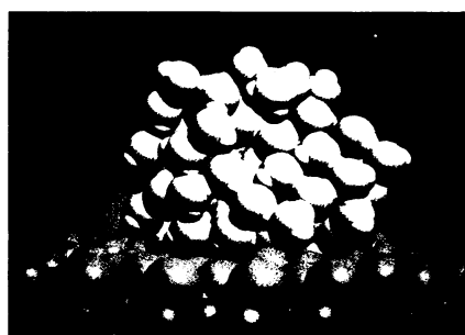
Computer simulation reveals that even a few water molecules (yellow) flatten out on charged surfaces (top), but form droplets on neutral surfaces (bottom).