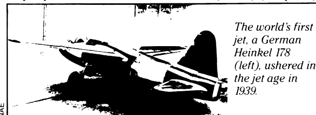
The world's first jet, a German Heinkel 178 (left), ushered in the jet age in 1939.

The National Academy of Engineering established the Draper prize in 1988 as a biennial award (SN: 10/1/88, p. 212).