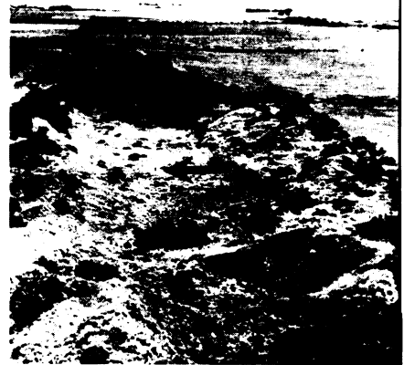
Arrow marks a person standing in one of the smaller oblong craters