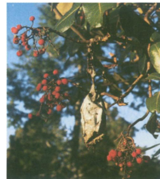
Silk cocoon of madrone butterfly strapped to a tree near Creel, Mexico.