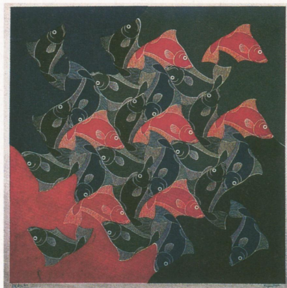
Woodcut of Escher drawing number 20 — decorative fish printed on white silk; c. 1942.

W.H. Freeman, 1990, 354 pages, 9¼" x 11¼", hardcover, $44.95