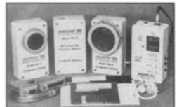
RM-70, RM-60, RM-80, LCD-60

Here is a new and exciting way of detecting and plotting radiation on your P.C. or LAPTOP with palm sized RM-60 Micro Roentgen Radiation Monitor . 1000X resolution of survey geigers. Detects: •Alpha •Beta •Gamma •X-ray. Features: •Glass-fused Stainless Steel GM tube •Alpha window •Alarm •Modular cable plugs into serial or printer port. •Extends over 5000 ft. •Powered from port •No batteries •Extremely accurate & rugged •Analyze/export data •TSR program/pop-up control panel •Track RADON GAS , find sources. Plot: •Background •Cosmic Rays •Clouds •Rocks •Airplane Ride. Check food, water, etc. •Excellent for lab, industry/education. WINDOWS compatible. PC Mag. & Byte reviews.