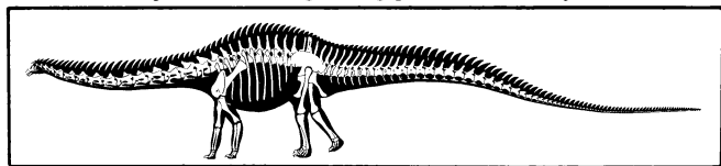
Fossilized skin impressions show that a row of spines ran along the tail of this dinosaur and perhaps continued along the length of its body.

New discoveries of dinosaur skin fossils are repainting the old picture of the largest beasts to ever walk the Earth. Researchers and artists alike have long envisioned sauropod dinosaurs with smooth skin that lacked any spiky protrusions. But dinosaur artist Stephen A. Czerkas reports finding evidence that at least one type of sauropod had scaly skin with formidable spines running along part of its body.