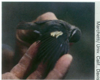
Warbler's painted wing bar.

Studies of closely related birds in the forests of Kashmir, India, have shed light on the role of habitat in the evolution of plumage color patterns. Birds living in dense woods tend to evolve bright patches that they keep hidden except when they want to show off to members of their species, says Karen Marchetti of the University of California, Davis.