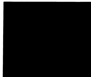
Computer-generated image of a neon atom in a buckyball.

A heated buckyball belches its helium atom out through a "window" that appears when bonds temporarily break in the structure, the group proposes. The energy from such heating is not enough to squeeze the atom through any of the intact rings, explains Saunders. As predicted, the team found it could also open the window to insert gases.