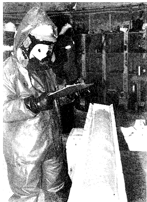
A member of the drilling crew examines a segment of the Greenland ice core.

mulation of snowfall each year, Greenland's ice cap contains trapped gases, chemicals, and dust that can reveal how the climate behaved at the time the snow fell. In studies of ice collected last year, GISP 2 scientists discovered that the climate of the North Atlantic took only a year or two to jump between ice age conditions and a much balmier state (SN: 12/12/92, p.404).