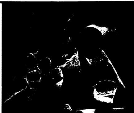
Cross section of hairs showing abnormal shapes under electron microscope.

Dermatologists have reported 50 cases of the medical syndrome, mostly