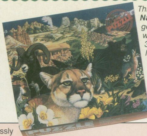
This poster illustration of Our National Parks contains geographical landmarks, wildlife and plant life from 34 National Parks and Monuments. These items are in approximate geographical order. For example, western parks are located to the left side, eastern parks to the right.

Expressly from Science News Books are five glorious Museum Puzzles featuring beautiful color photographs and exquisite watercolor and oil paintings of science and nature subjects at their finest. Enjoy challenging your mind and creating stunning full-color jigsaw images. These puzzles also help you learn about the subject matter as each contains a labeled color photograph of the image distinguishing what each element is and, when appropriate, where it is found. Choose from Shells of the Land and Sea , Our National Parks , Wetlands , Gemstones , and Tropical Fish of the World . Each puzzle is comprised of 500 pieces, measures 14" x 18", and costs only $12.95.