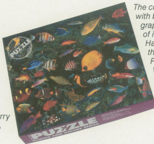
The coral reef explodes with beautiful color photographs by Aaron Normal of its inhabitants the Harlequin Tuckfish of the Tropical Western Pacific, the Redtail Wrasse of the Tropical Central Pacific, and 42 other Tropical Fish of the World .

Science News Books 1719 N Street, NW, Washington, DC 20036