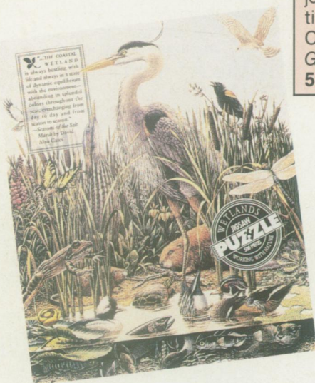
A watercolor adaptation of the Wetlands by Larry Duke exemplifies this habitat at every level sky, land, water surface, and below sea level. An accompanying flyer identifies most of the creatures in the picture.

Expressly from Science News Books are five glorious Museum Puzzles featuring beautiful color photographs and exquisite watercolor and oil paintings of science and nature subjects at their finest. Enjoy challenging your mind and creating stunning full-color jigsaw images. These puzzles also help you learn about the subject matter as each contains a labeled color photograph of the image distinguishing what each element is and, when appropriate, where it is found. Choose from Shells of the Land and Sea , Our National Parks , Wetlands , Gemstones , and Tropical Fish of the World . Each puzzle is comprised of 500 pieces, measures 14" x 18", and costs only $12.95.