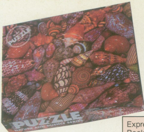
Shells of the Land and Sea is an intriguing collage of shells from a photograph by Pete Carmichael.