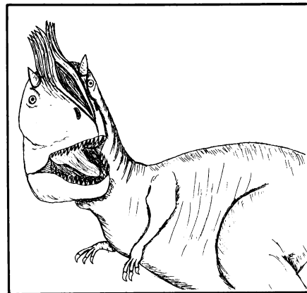
William J. Hickey

The Elvis look-alike belonged to a group of carnivorous bipedal dinosaurs known as theropods, which included the infamous Tyrannosaurus rex . The Antarctic animal's head crest was a thin layer of grooved bone that most likely served as a display, much like the tail of a male peacock, says Hammer. Although some theropods had crests run-