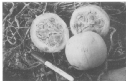
Minipumpkin's stripped seeds.

calls Snackjack — is currently being grown for commercial introduction, perhaps in 1995. His hybrid's seeds "are up around 40 percent protein," Loy says. Though typically about 45 percent fat by weight, the hull-less seeds are almost free of saturated fat and contain a 1:3 ratio of mono- to polyunsaturates.