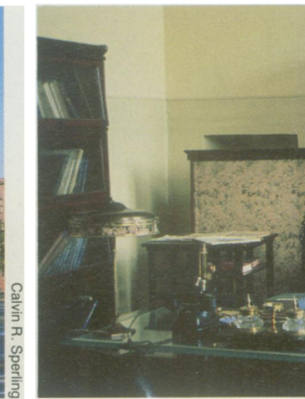
Calvin R. Sperling

slightly different traits that plants have developed in response to particular climate, soil, parasite, and other environmental conditions.