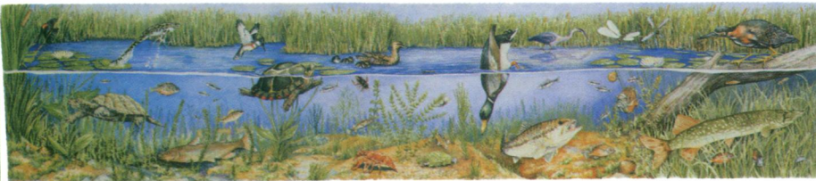
Pond Panorama, 60" x 12", 48 pieces