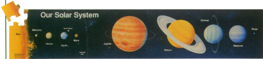
Solar System, 60" x 12", 48 pieces

These giant floor puzzles capture the enormity of the subjects they depict. They will fascinate children, who can create creatures that rival their own size. Small children find the giant pieces easy to handle and match, helping to develop their motor and visual discrimination skills as well as to teach the patience necessary to complete a task. The Endangered Animals and Pond Panorama puzzles include an identification key and Tyrannosaurus and Triceratops come with fact sheets providing additional knowledge about the pictured animals. Kids learn while they are having fun.