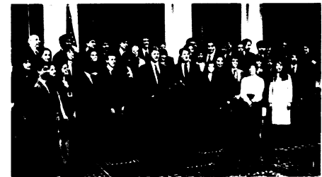
Contestants met with President Clinton and Vice President Gore.