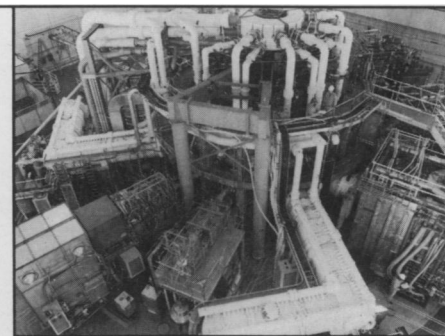
The Tokamak Fusion Test Reactor.

The researchers also note that the tritium-deuterium plasma used in the experiments stores about 20 percent more energy in its electrons and ions than a pure deuterium plasma. Such an increase indicates that the presence of tritium improves particle confinement and that alpha particles may be directly