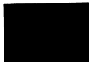
Computer model of a heart valve.

"Here the designer may, in one session, investigate a broad range of valve designs," he adds, "each providing important information on the flow over the valve surface."