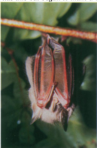
The red fig-eating bat.