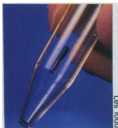
A polyurethane-coated microchip for identifying animals.

Researchers want to make sure that the microchips stay put in the captive primates before using them in animals released into the wild, says Feeder. The chips would replace collars, dyes, and tags, all of which have disadvantages, she adds.