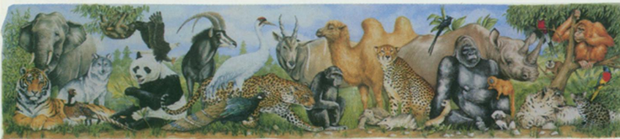
Endangered Animals, 60" x 12", 48 pieces