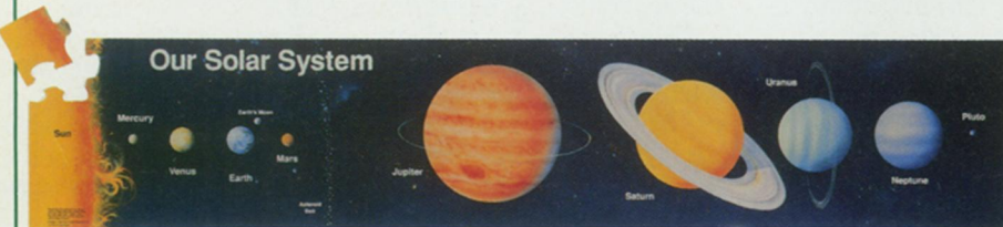
Solar System, 60" x 12", 48 pieces

Frank Schaffer Publications, 48 to 50 pieces, all puzzles $12.95 each. Save and buy all five for $55.95.