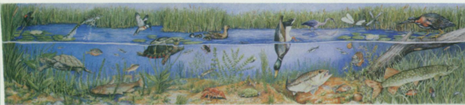
Pond Panorama, 60" x 12", 48 pieces

Order by phone for faster service! 1-800-544-4565 (Visa or MasterCard Only) In D.C. Area: 202-331-9653