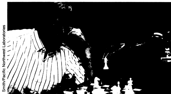
A new robotic hand goes for a checkmate.

Originally developed to handle radioactive materials at nuclear power plants, Smith later adapted the hand for general civilian use. Designed to mimic the shape and grasp of a human hand, with four fingers and an opposable thumb, the prosthetic works reliably even in moist, oily, and dirty environments.