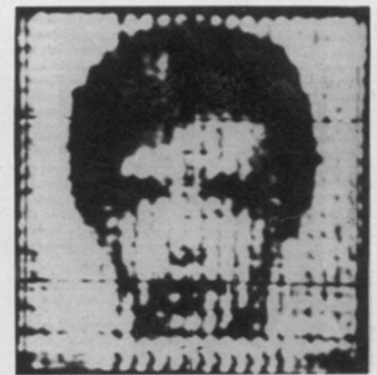
A 400-count representation of a woman's face as seen on the monitor oscilloscope. Subjects can correctly identify stimulus patterns at this level of complexity.

What is consciousness? How did it evolve? Do animals have it, too? Find out with the 4-volume Frontiers of the Mind Library, a $97.40 value, yours for only $2.95.