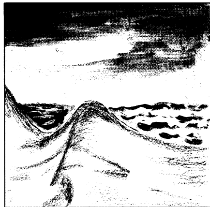
Tidal pools on primitive Earth, drying under a hot sun, may have spawned cytosine and uracil, two bases needed for emerging RNA molecules.

nated, people are wondering how, in a primitive environment, without enzymes, the building blocks of biological molecules could have formed. The pyrimidines have presented a nagging