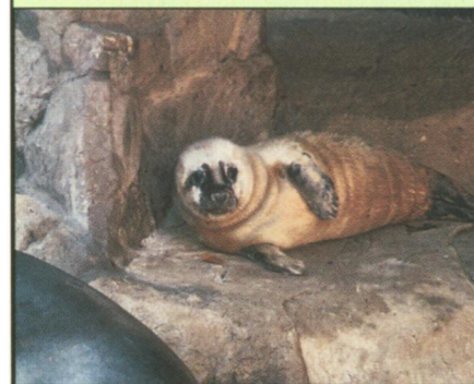
A gray seal.

"These data challenge our rather smug beliefs about mating systems, says Phil Clapham of the Smithsonian Institution's National Museum of Natural History in Washington, D.C. "This is the first I've seen of something like this in a seal,"