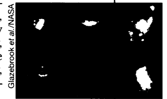
New class of irregular galaxies.