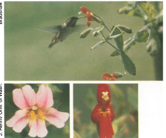
A hummingbird visits Mimulus cardinalis (above and below right) but won't pollinate M. lewisii (below left)

In the Aug. 31 NATURE, they report finding that for each trait, at least one gene proved responsible for more than 25 percent of the variation within a sampled population of hybrid flowers. For example, M. cardinalis produces 80 times