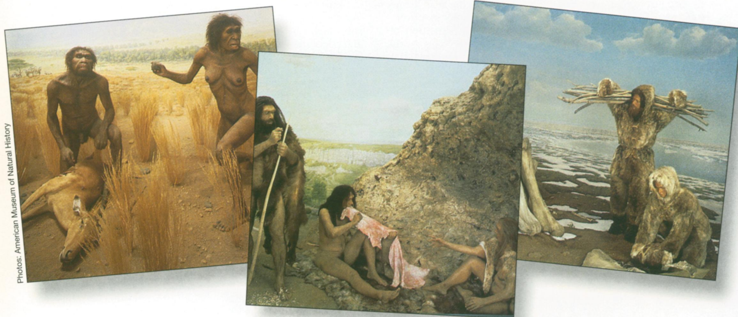
Displays at the American Museum of Natural History's Hall of Human Biology and Evolution in New York City show, left to right, 1.7-million-year-old Homo ergaster , 50,000-year-old Neandertals, and 15,000-year-old H. sapiens .

A rguments for lumping diverse hominid remains into only a few species extend back at least 25 years. But scientific opinion currently favors expanding the number of hominid