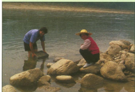
Sieving for fossils in the Yellow River.