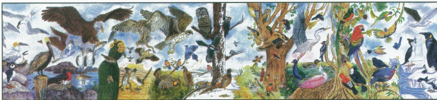
Birds, 60" x 12", 48 pieces

Recommended for age 4 and up. Frank Schaffer Publications, all puzzles $13.95 each. Save and buy all five for $59.95.