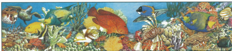
Coral Reef, 60" x 12", 48 pieces

Order by phone for faster service! 1-800-544-4565 (Visa or MasterCard Only) In D.C. area: 202-331-9653