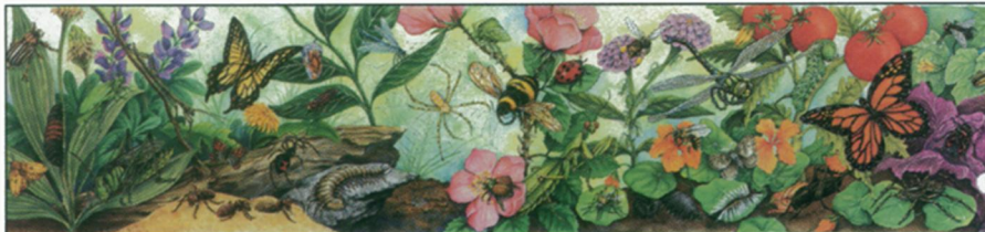
Backyard Bugs, 60" x 12", 48 pieces