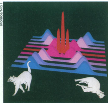
A single atom can appear in two places at the same time, shown here by paired probability curves.

While this experiment ignores macroscopic effects on objects such as Schrödinger's cat, it may at least have demonstrated, says Zurek, "the paradox of Schrödinger's kitten." — R. Lipkin