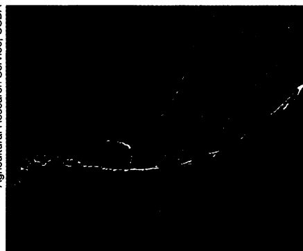
A tomato hornworm.

At the summer temperatures, pairs of compounds produced the greatest negative effect, whereas in the cooler air, single chemicals did. But since the chemicals varied in their effects on a particular insect, plants would fare best if armed with all three allelochemicals, they assert.