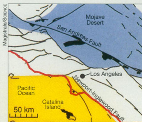
Schist surface outcrops are shown in black, desert schist in blue, Catalina schist in yellow. Red line indicates Southern California coast.