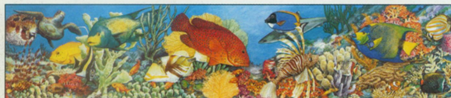
Coral Reef, 60" x 12", 48 pieces

Order by phone for faster service! 1-800-544-4565 (Visa or MasterCard Only) In D.C. area: 202-331-9653