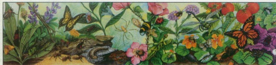
Backyard Bugs, 60" x 12", 48 pieces