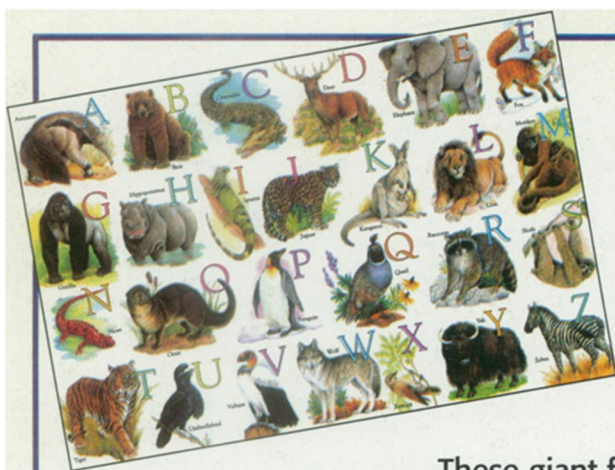
Animal Alphabet, 24" x 36", 26 pieces

These giant floor puzzles capture the enormity of the subjects they depict. They fascinate children, who can create scenes and