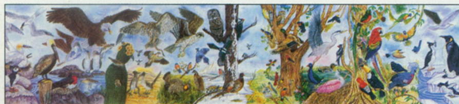
Birds, 60" x 12", 48 pieces

Recommended for age 4 and up. Frank Schaffer Publications, all puzzles $13.95 each. Save and buy all five for $59.95.