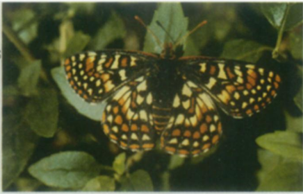
Female Edith's checkerspot.