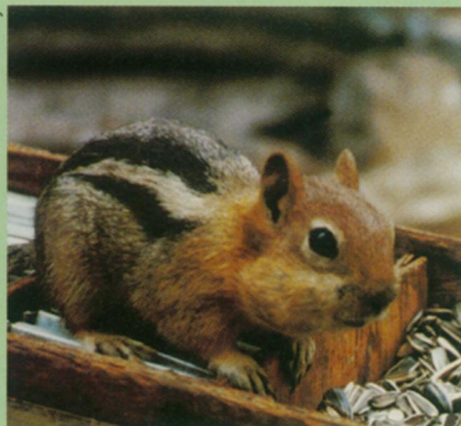
A wild golden-mantled ground squirrel filling its pockets before hibernation.