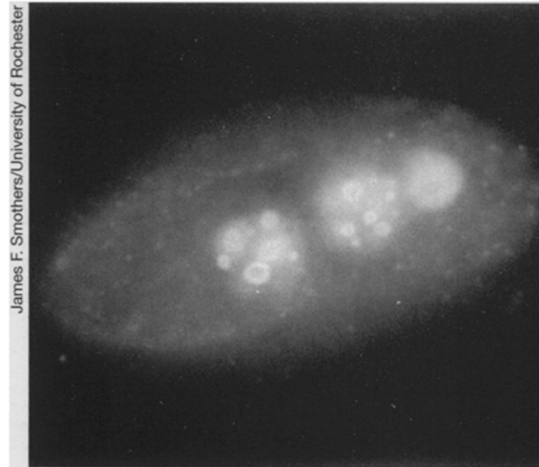
Circular bands of destruction: Proteins dissolve parental genes in a tetrahymena cell.

When two famished tetrahymena encounter each other, their cell walls dissolve and the pair joins. Their micronuclei break apart and fuse into a larger nucleus. There, some genes exchange places, moving from a chromosome of one parent to a chromosome of the other. Finally, the nucleus splits into eight parts, four of which become macronuclei and four