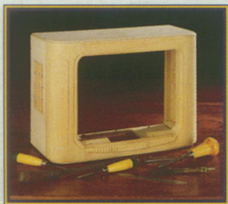
Hand-finished, all-wood cabinet produces incredibly rich sound.

Grundig craftsmen take hours to handcraft, stain and lacquer each cabinet from wood, one of the secrets to Grundig's velvety tone. The gold-tone illuminated dial and knobs are accented with real brass. The speakers are covered with thick, top-quality fabric. There's nothing like it anywhere... at any price.