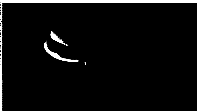
The human Y chromosome (center) harbors a gene copied from a chromosome 3 gene.