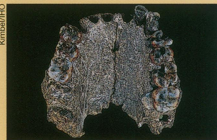
Early Homo upper jaw found at Hadar, Ethiopia.