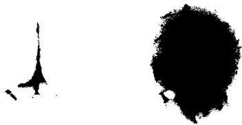
Blue dye enters an unstressed mouse's brain (left) less readily than a stressed one's brain (right).